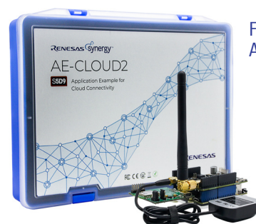
Free Renesas AE-CLOUD2 Kit